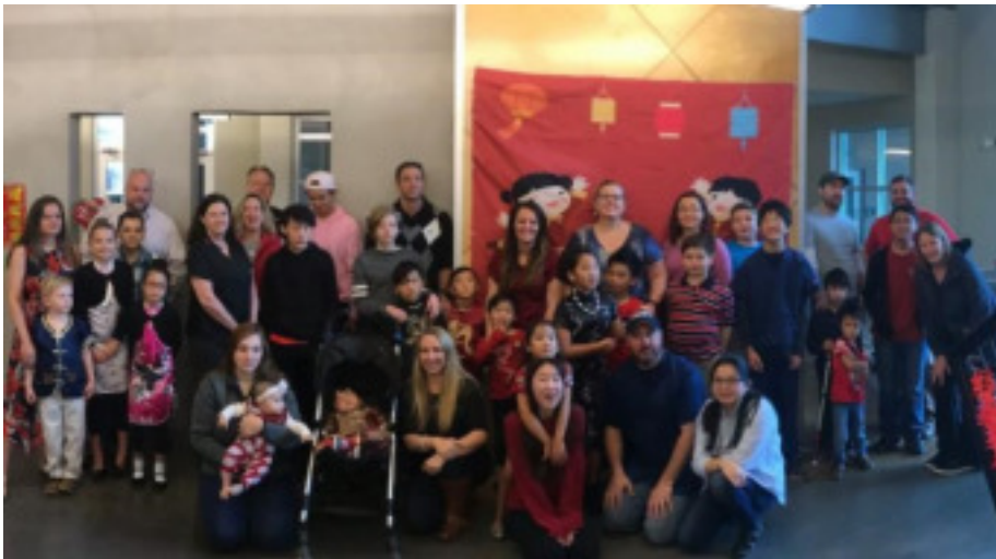
Celebrating culture has been a big part of our ministry. Instilling tradition and cultural identity is an integral part of adoption. This tradition has grown over the years and offers an opportunity to learn and grow as a community.